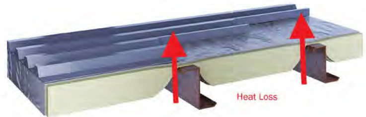
Without Thermal Spacer Block Material

The purpose of a thermal break is to reduce the impact of thermal bridging by preventing conductive heat flow through the building thermal envelope. Thermal breaks also help to keep surface temperatures within the thermal envelope above the dew point. This eliminates potential condensation risk.